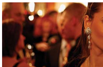
Glamour at the Galanight .... 2