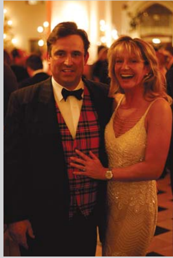
A lot of glamour at the Polo-Galanight at the Badrutt's Palace Hotel