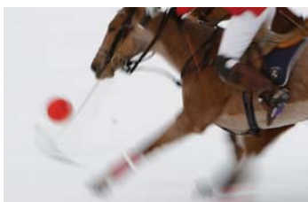
Cartier or Brioni?