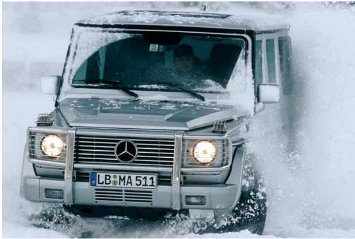
Mobility on snow with AMG

Mercedes-AMG GmbH, founded in 1967, is the high-performance brand from Mercedes-Benz. AMG stands for dynamism, individuality and self-assurance combined with technological innovation. The current range consists of 16 AMG high-performance vehicles. Every year, AMG goes back to its roots on the racetrack, experiencing all the thrills and excitement of the German Touring Car Championships. Mercedes-AMG