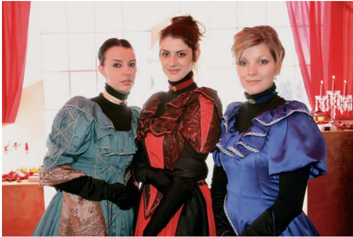
Representatives of the Palisades project

The ambassadors spreading the word about The Palisades, an architectural vision currently taking shape in Dubai, are doing so with typical Oriental charm.